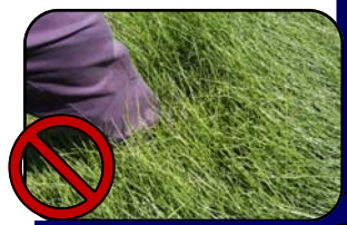
Too Much Top Growth