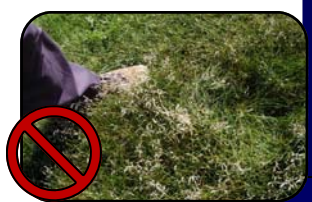
Too Many Seedheads