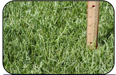
Beautiful turf that requires less mowing, My Holiday Lawn™

When My Holiday Lawn™ is mowed, the leaf growth is only partially removed, keeping your lawn looking fresh and green. Not brown and stemmy like ordinary lawnglass.