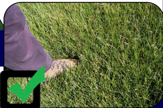
My Holiday Lawn™, shown here one month after summer mowing

Jacklin Seed by Simplot is excited to introduce My Holiday Lawn™, a Kentucky bluegrass that can be mowed as little as ONCE A MONTH, as opposed to the 1 or 2 mows PER WEEK current normal lawngrasses require.